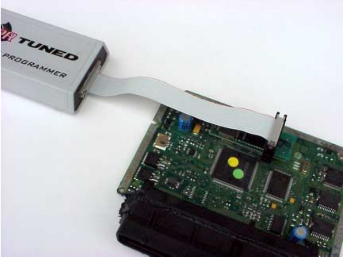
EMCS programmer connected to EMCS module