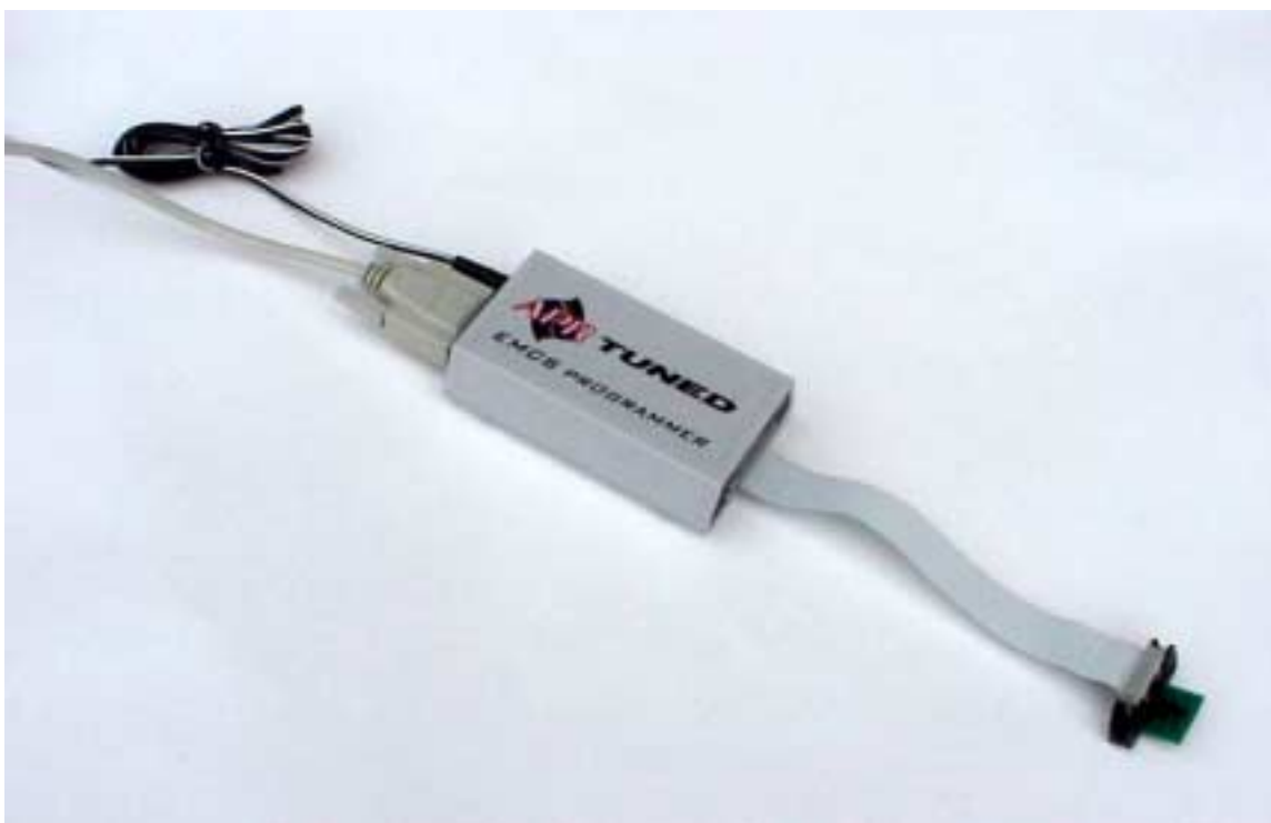
EMCS Home Computer Upgrade Interface