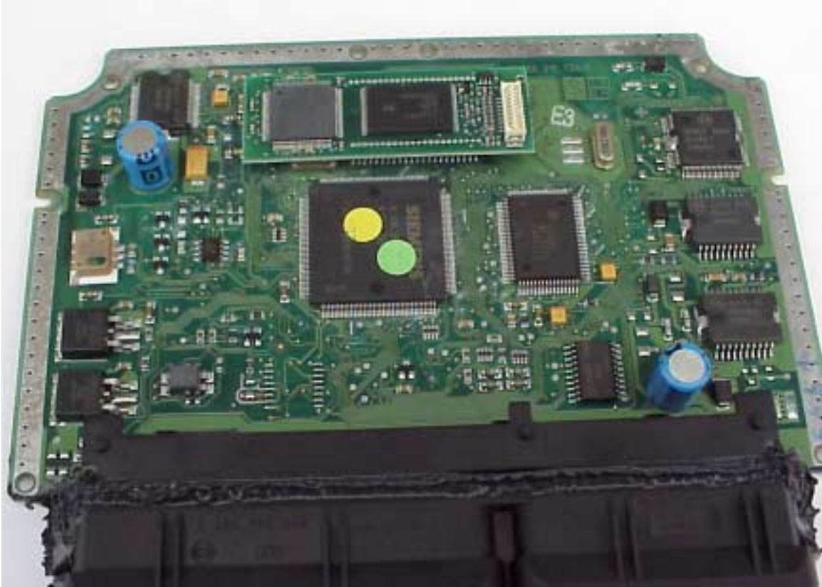
ECU with EMCS module